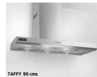
TAFFY 90 cms • Digital control with timer • Airflow 1250 m 3 /h • 3x1.5 W LED lamps • Seamless telescopic tube