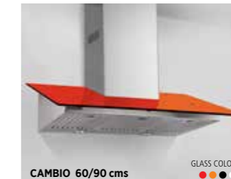
CAMBIO 60/90 cms • Digital control with timer • Airflow 1250 m 3 /h • 2x1.5 W LED lamps • Choice of colours