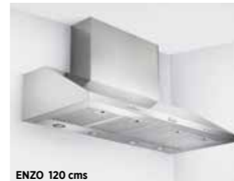
ENZO 120 cms • Digital control with timer • Powerful double airflow 2500 m 3 /h • 4x1.5 W LED lamps • Twin motor