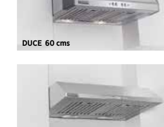
DUCE 60 cms