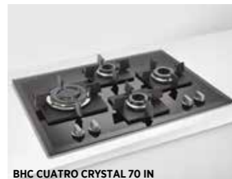
BHC CUATRO CRYSTAL 70 IN • 8 mm thick toughened glass • Cast iron pan supports & base • Double ring burner • Italian gas valve