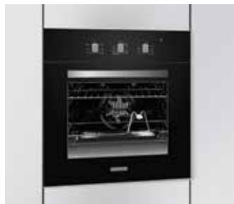
BOC 601 TMR Vol. 59 lts.