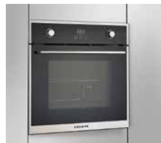
BOC 604 TMR Vol. 59 lts.