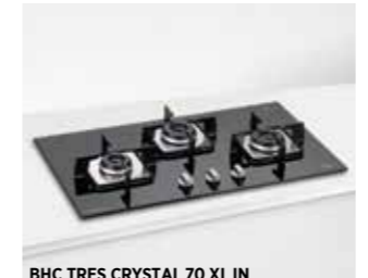
BHC TRES CRYSTAL 70 XL IN • 8 mm thick toughened glass • MS pan supports • Double ring burner • Italian gas valve