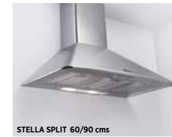
STELLA SPLIT 60/90 cms • Indoor & outdoor units • Airflow 1250 m 3 /h • PDCA housing • Sliding Switch/Push button control