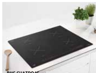
BHC CUATRO IC • 4 Induction zones • 9 Level digital power display for each zone • Boost function for instant power