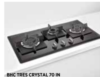
BHC TRES CRYSTAL 70 IN • 8 mm thick toughened glass • Cast iron pan supports & base • Double ring burner • Italian gas valve