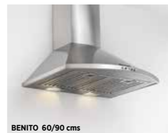
BENITO 60/90 cms • Airflow 1000/1250 m 3 /h • FRP/PDCA housing • Baffle filter • Push button control