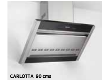
CARLOTTA 90 cms • 3 layer Cassette & Baffle filter • Airflow 1100 m 3 /h • Touch control • Removable oil collector