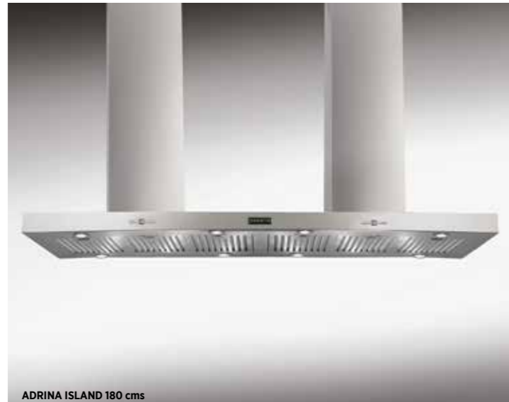
ADRIANA ISLAND 180 cms For Large Modern Kitchens • Powerful double suction 2500 m 3 /h • Twin motor (option of single or twin operation) • Baffle filter • Twin telescopic tube • PDCA housing • 8 Energy saving LED lamps • Digital control with timer