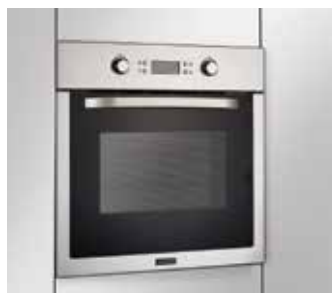
BOC 606 TURBO Vol. 59 lts.