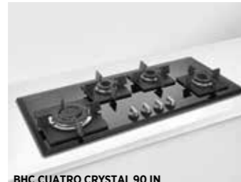
BHC CUATRO CRYSTAL 90 IN • 8 mm thick toughened glass • Cast iron pan supports & base • Double ring burner • Italian gas valve