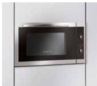
BOC 901 TURBO + MR Vol. 98 lts.