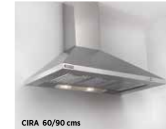
CIRA 60/90 cms • Digital control with timer • Airflow 1000/1250 m 3 /h • FRP/PDCA housing • Baffle filter