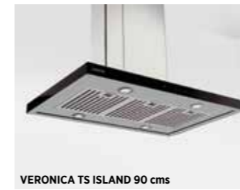
VERONICA TS ISLAND 90 cms • Touch sensor control • Airflow 1250 m 3 /h • 4x1.5 W LED lamps • Toughened glass front panel