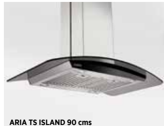
ARIA TS ISLAND 90 cms • Touch sensor control • Airflow 1250 m 3 /h • 4x1.5 W LED lamps • Toughened glass front panel