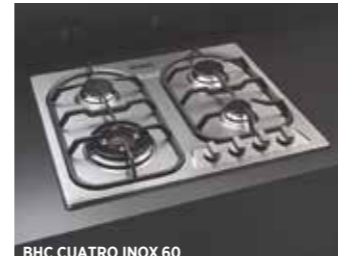
BHC CUATRO INOX 60 • Matt Steel • Cast iron pan supports • Triple ring burner • Italian gas valves