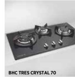
BHC TRES CRYSTAL 70 • Toughened glass • Triple ring burner • Italian gas valves • Cast iron pan supports