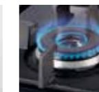
ITALIAN DOUBLE RING BURNER Specially designed to provide more heat for Indian style cooking, these burners are surely a pleasure to work with.