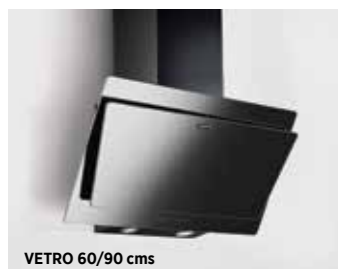
VETRO 60/90 cms • Touch control • Airflow 1000 m 3 /h • 2x1.5 W LED lamps • Metal housing • Cassette filter