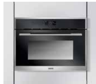
STEAM Oven BOC 605 SO Vol. 35 lts.