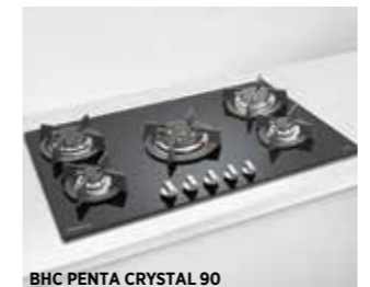
BHC PENTA CRYSTAL 90 • Toughened glass • Triple ring burner • Italian gas valves • Cast iron pan supports