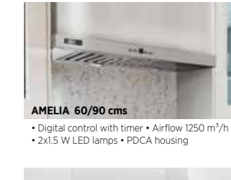
AMELIA 60/90 cms • Digital control with timer • Airflow 1250 m 3 /h • 2x1.5 W LED lamps • PDCA housing