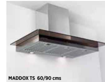
MADDOX TS 60/90 cms • Touch sensor control • Airflow 1000 m 3 /h • 2x1.5 W LED lamps • Toughened glass front panel