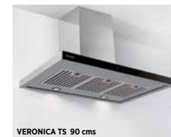
VERONICA TS 90 cms • Touch sensor control • Airflow 1250 m 3 /h • 2x1.5 W LED lamps • Toughened glass front panel