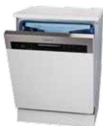
DWC 7309 K

• Fully integrated • Third layer cutlery basket • Electronic control • 6 washing programs • 3/6/9/12 hours delay start • Half load function