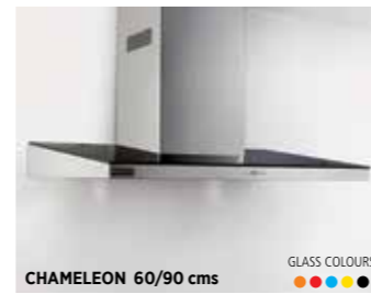
CHAMELEON 60/90 cms • Digital control with timer • Airflow 1250 m 3 /h • 2x1.5 W LED lamps • Choice of colours