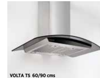
VOLTA TS 60/90 cms • Touch sensor control • Airflow 1000/1250 m 3 /h • 2x1.5 W LED lamps • Toughened glass front panel