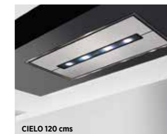
CIELO 120 cms • Airflow 1250 m 3 /h • 4 Energy saving LED lamps • Remote control • Energy efficient S type motor