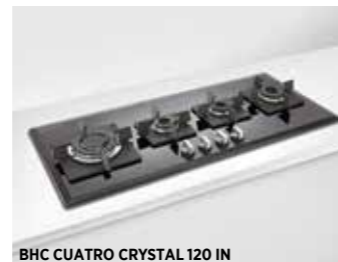
BHC CUATRO CRYSTAL 120 IN • 8 mm thick toughened glass • Cast iron pan supports & base • Double ring burner • Italian gas valve