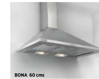
BONA 60 cms • Baffle filter • Airflow 1000 m 3 /h • FRP Housing • Push button control