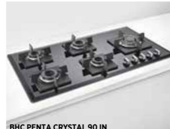
BHC PENTA CRYSTAL 90 IN • 8 mm thick toughened glass • Cast iron pan supports & base • Double ring burner • Italian gas valve