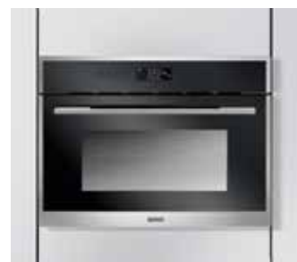
COMBI Oven MO 622 Vol. 35 lts.

• SS cavity & handle bar • Maximum load 20 Kg • Hot air fan system for heating crockery • Adjustable temp. 30-80°C • Illuminated on/off switch • Telescopic full-depth pull-out with press+release mechanism • Anti slip mat, Cool door.