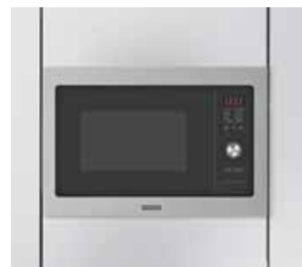
Microwave MO 624 Vol. 28 lts.