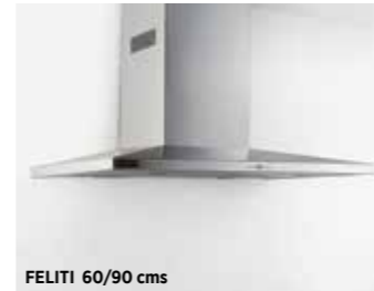
FELITI 60/90 cms • Digital control with timer • Airflow 1250 m 3 /h • 2x1.5 W LED lamps • Noise reduction system