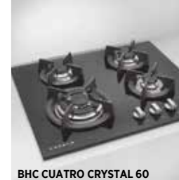
BHC CUATRO CRYSTAL 60 • Toughened glass • Triple ring burner • Italian gas valves • Cast iron pan supports