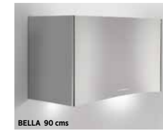
BELLA 90 cms • Digital control with timer • Airflow 1250 m 3 /h • 2x1.5 W LED lamps • PDCA housing • Baffle filter