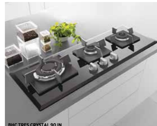
BHC TRES CRYSTAL 90 IN • 8 mm thick toughened glass • Cast iron pan supports and base • Double ring burner • Italian gas valve for no sim-off • Integrated auto ignition