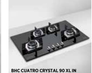
BHC CUATRO CRYSTAL 90 XL IN • 8 mm thick toughened glass • MS pan supports • Double ring burner • Italian gas valve