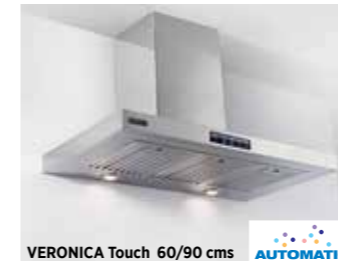
VERONICA Touch 60/90 cms • Heat & Gas Sensor • Airflow 1250 m 3 /h • 2x1.5 W LED lamps • Touch control • Auto off Timer