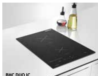
BHC DUO IC • 2 Induction zones • 9 Level digital power display for each zone • Automatic safety shut-off